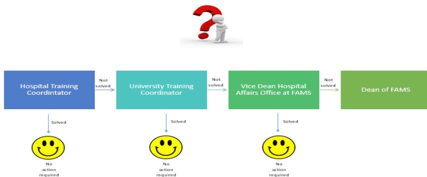
Figure 1: Problem solving flow chart